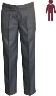
Trouser Pleat front Grey