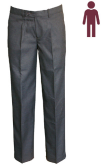
Trouser Pleat front Grey