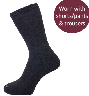
Sock Grey 3 Pkt