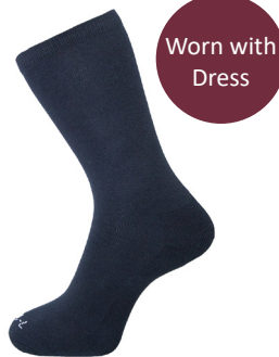
Sock Navy 3 Pkt