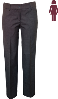
Pants Tailored Grey