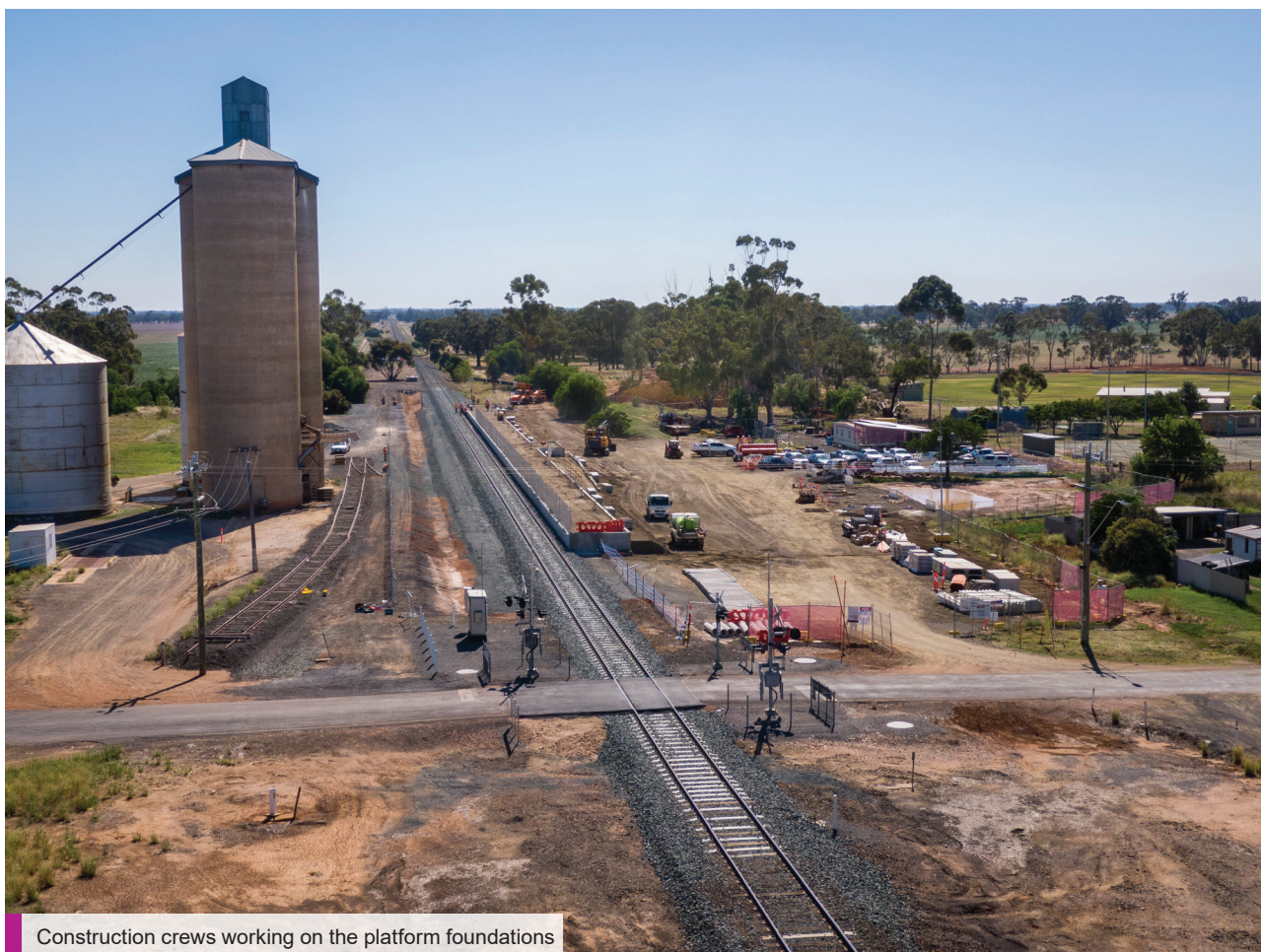
Construction crews working on the platform foundations