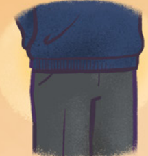
SO IT CAN'T BE SEEN UNDER JUMPER OR BLAZER