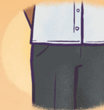
NEATER SHIRT EDGE

The college shirts are designed to be worn untucked, without being seen below either the college blazer or jumper.