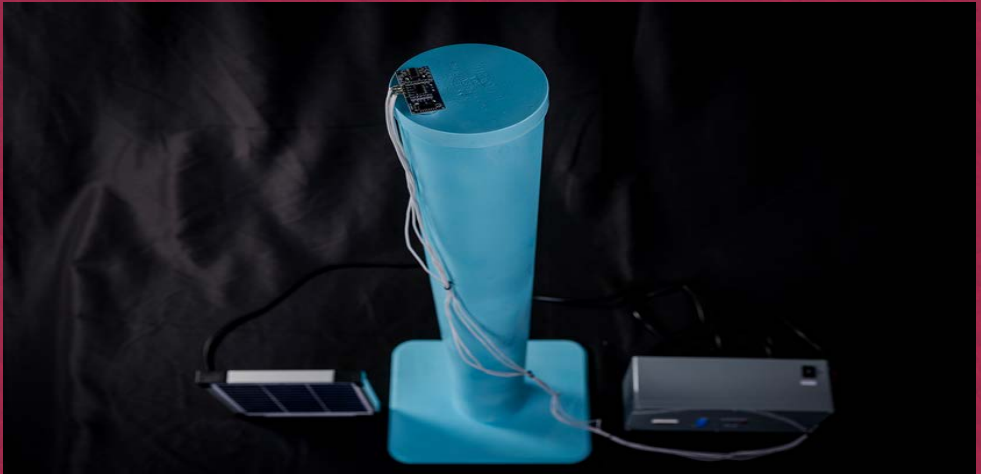
Alistair - Off-Grid Digital Water Tank Meter