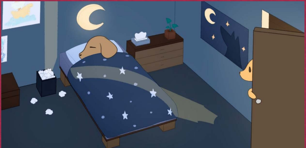
Kira - Noodog