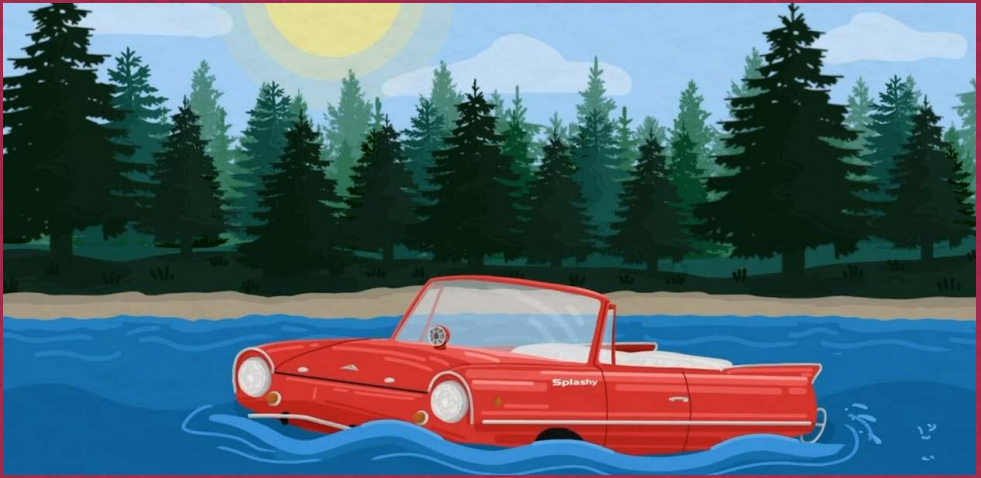
Faith - Amphicar770