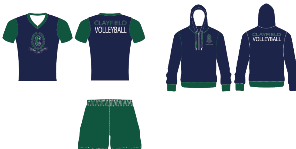
College bike pants

CLAYFIELD COLLEGE VOLLEYBALL ACADEMY UNIFORM (ONE SHORT SLEEVE, ONE LONG SLEEVE)