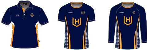
POLOS + T-SHIRTS (Polo pattern code = SC0305SP | T-shirt pattern code = SC0305ST)

**Polos and Training Tops are the same fit