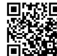
Scan to view the woodhouse and Adelaide Zoo website