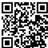
Scan to view Morialta Conservation park Website