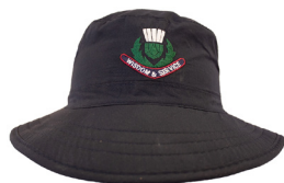
Hat Hybrid Navy

For current prices, please refer to www.bobstewart.com.au