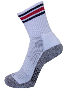
Sports Sock 2 pkt