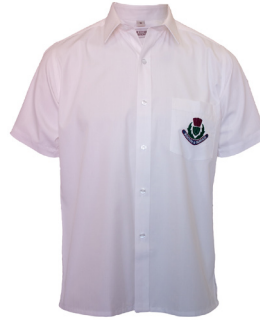
Short Sleeve Shirt