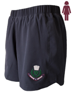
Sport Shorts with Inner