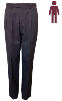
Trouser Pleat front Grey