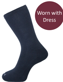
Sock Navy 3 Pkt