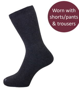
Sock Grey 3 Pkt