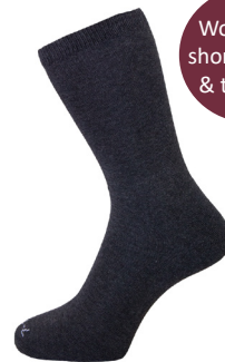
Sock Grey 3 Pkt