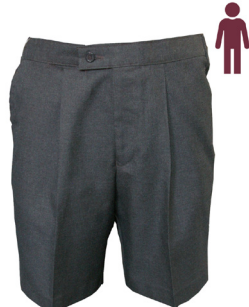
Senior Shorts Belt Loop