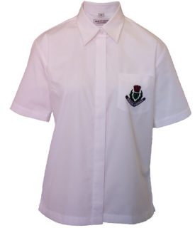
Short Sleeve Blouse