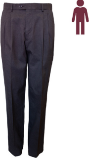
Trouser Pleat front Grey