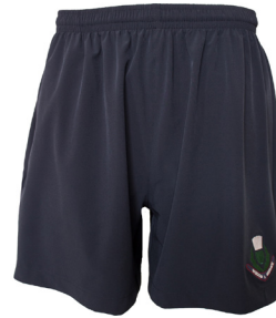
Sport Shorts Unisex