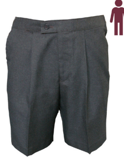
Senior Shorts Belt Loop