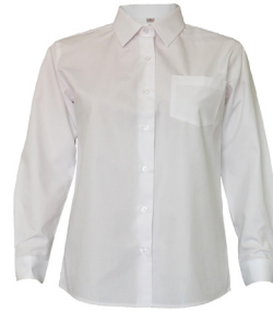
Blouse Long Sleeve