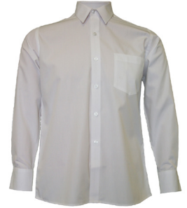
Shirt Long Sleeve