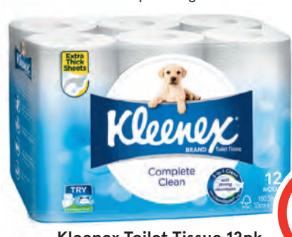
Kleenex Toilet Tissue 12pk 28c per 100 sheets