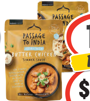
Passage to India Simmer Sauces 375g 76c per 100g