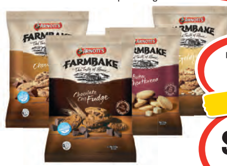
Arnotts Farmbake Cookies 310g 76c per 100g