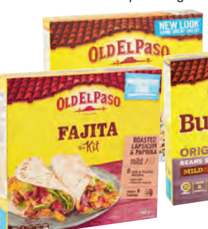
Old El Paso Meal Kits 290-520g