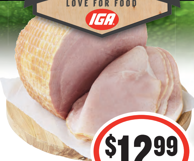
Primo Champagne Leg Ham