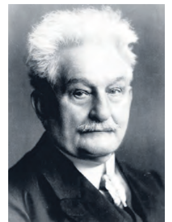
Leos Janacek.

Tickets include tea/coffee and scones with jam and cream on arrival and throughout the concert and are available on TryBooking.