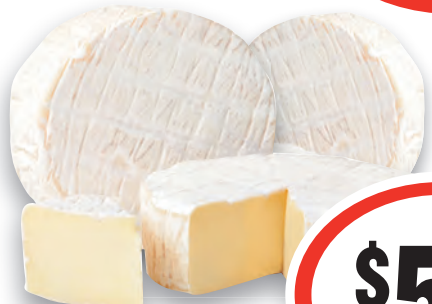
South Cape Brie or Camembert 200g $29.95 per kg