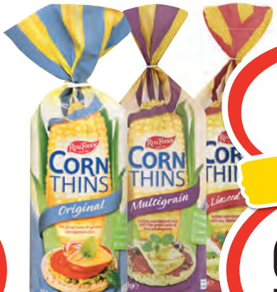
Real Corn or Rice Thins 150g 66c per 100g