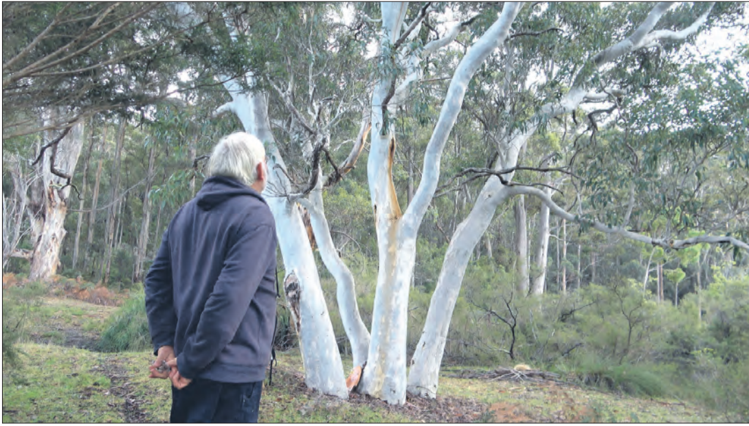
Basil Schur among the rare and endangered Eucalyptus virginea .

Growing taller than wandoos growing to 20m with white, pow-