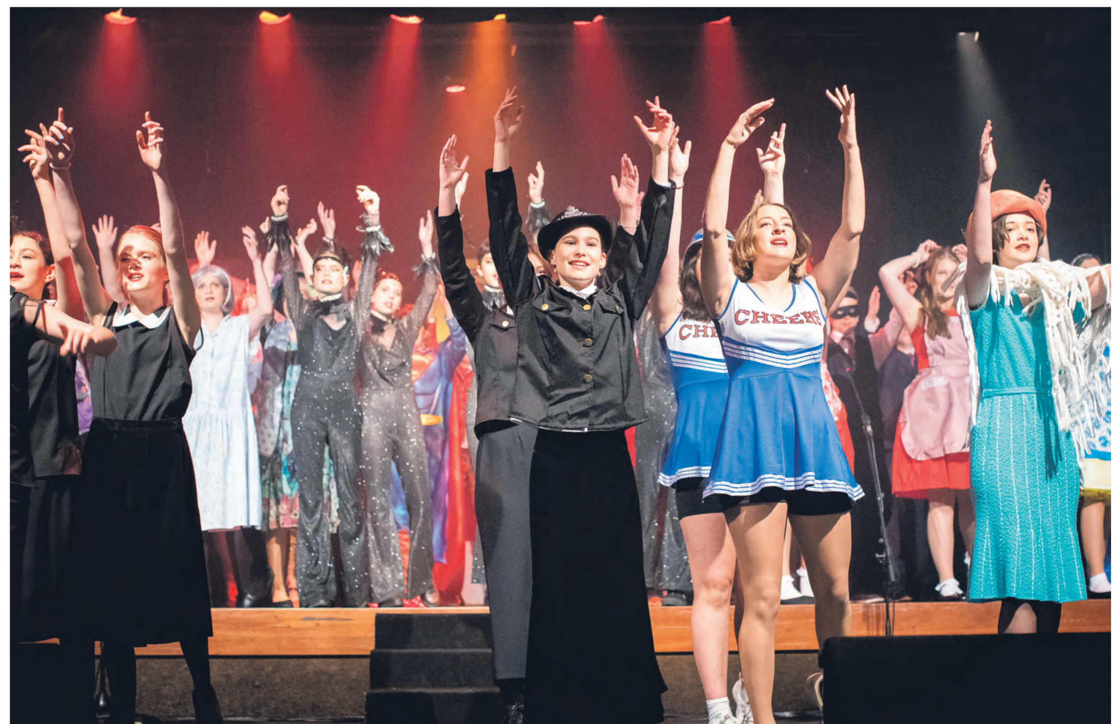
Left: The cleaning ladies unite as they sing about their work. The cast gives all for the final songs.