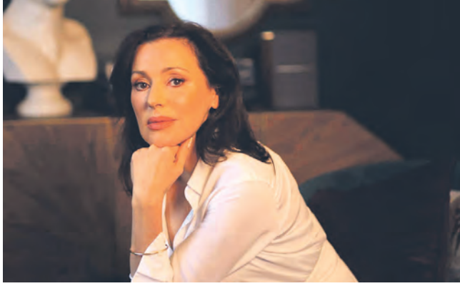
STAR SUPPORT: Tina Arena.

It would incorporate a paddock to plate, sustainable food ethos