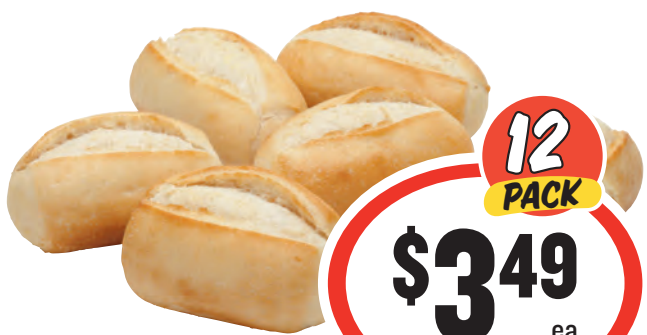
Entertainer Rolls 12pk