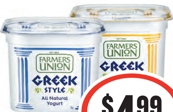
Farmers Union Greek Style Yoghurt 1kg 50c per 100g