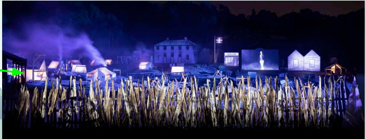
AURA Sound & Light Show

$400 per child - this will be added to school fees via the office if you consent for your child to attend camp. If you have a Health Card, you may be entitled to the CSEF government funding support for camps. Please see the office for further details.