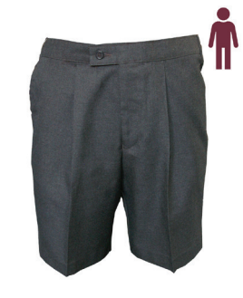
Senior Shorts Belt Loop