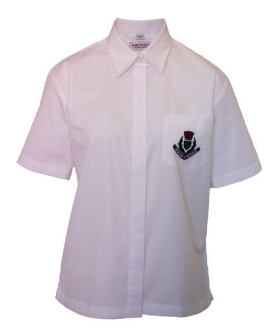
Short Sleeve Blouse