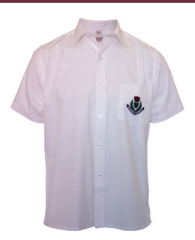
Short Sleeve Shirt