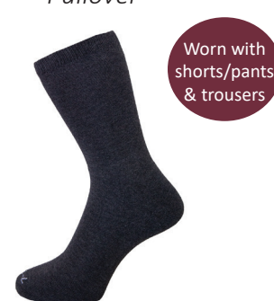
Sock Grey 3 Pkt