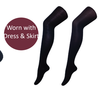
Tights Opaque / Bamboo Navy

For current prices, please refer to www.bobstewart.com.au