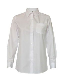
Blouse Long Sleeve