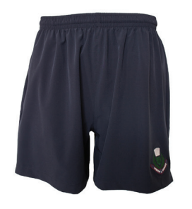
Sport Shorts Unisex