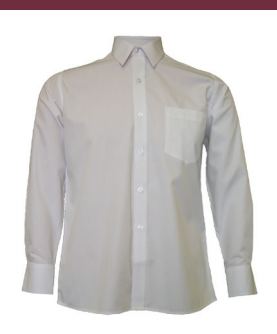
Shirt Long Sleeve