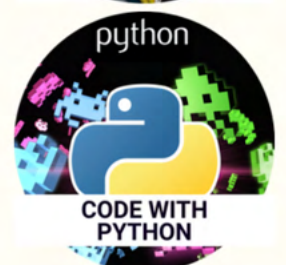
CODE WITH PYTHON