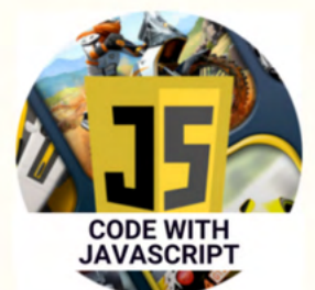
CODE WITH JAVASCRIPT