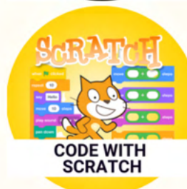
CODE WITH SCRATCH