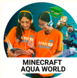
MINECRAFT AQUA WORLD