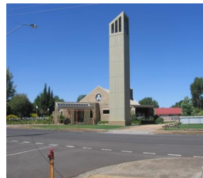
St Joseph's Cobram 6-8 William Street PO Box 424 Cobram, Vic 3644