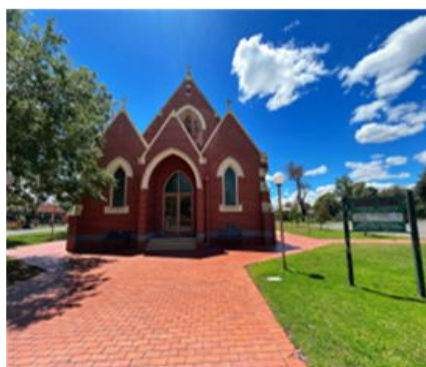
Sacred Heart, Yarrawonga Cnr Murphy & Witt Streets PO Box 36, Yarrawonga Vic 3730