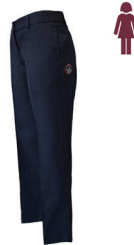
Pants Tailored (girls)