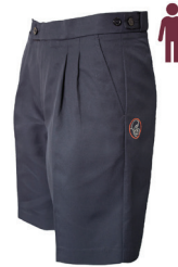
Shorts Pleated (boys)