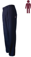
Trousers Pleated (boys)