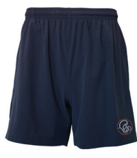
Sport Short Unisex Stretch Microfibre