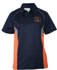
Polo Short Sleeve