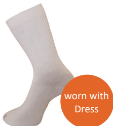
Socks White 2 pkt