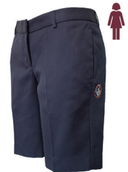
Shorts Tailored (girls)