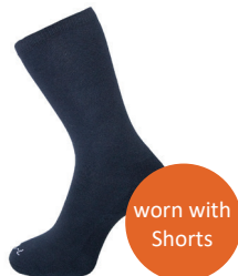
Socks Navy 3 pkt