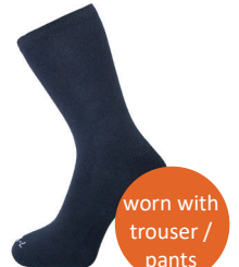
Socks Navy 3 Pkt