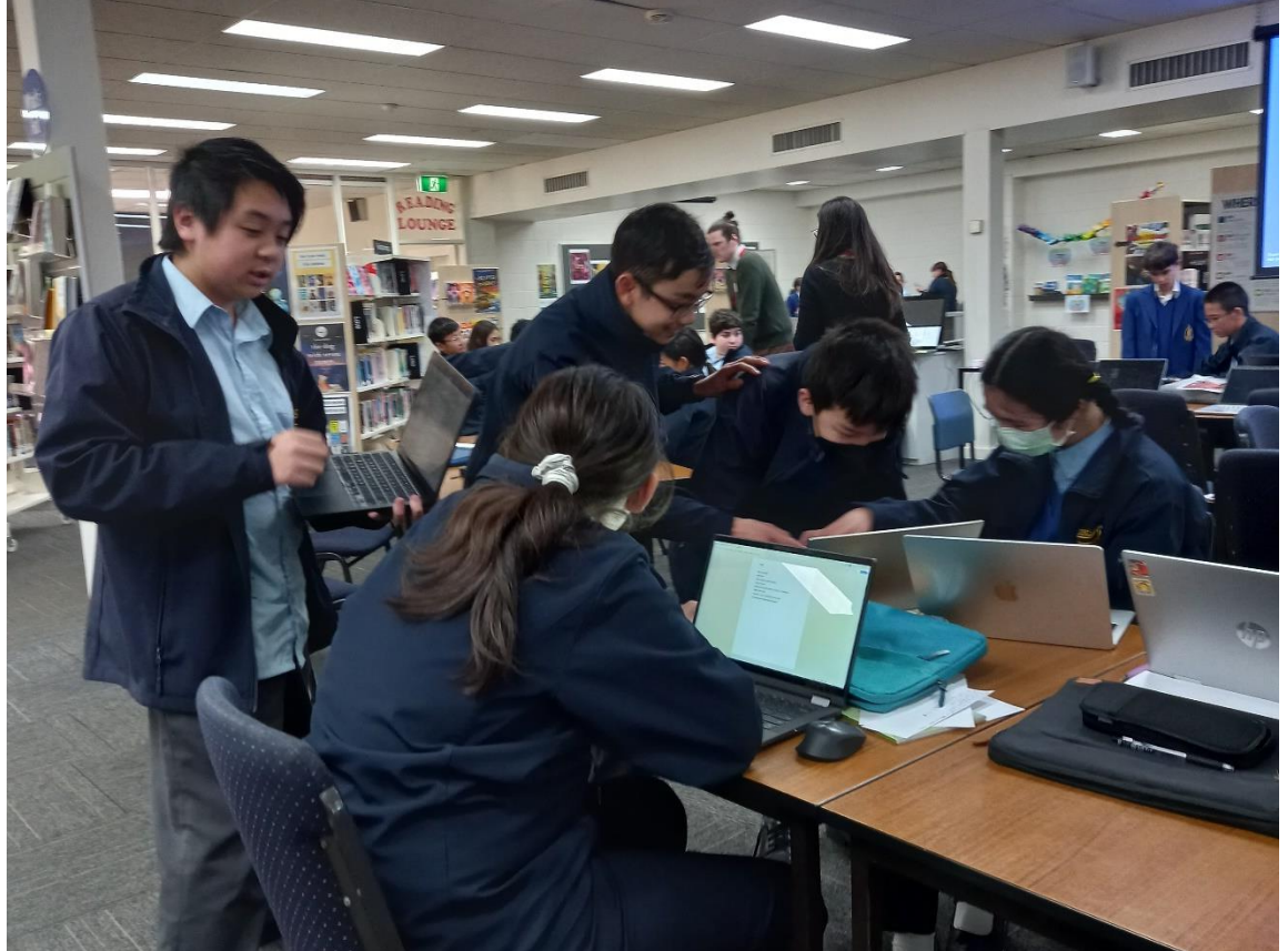
Students in the works at the VHAP Masterclass.

People attend VHAP in a ten-week online course in both Math and English for students in years 5-8. Students engage in Webex classes with their online teachers, along with other students from various schools who are also participating in the program. In the VHAP English course, students explore reality and fiction by noticing the world around them, and their journeys into fictional worlds. VHAP English empowers students through boosting their reading abilities, and confidence, in not only reading and writing, but also their public speaking as they share their story with the rest of their online class.