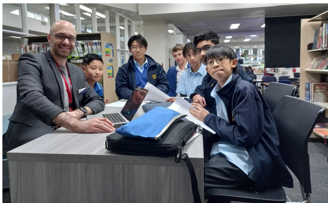
The image shows students from East Doncaster and Koonung working together in the Koonung Secondary College school library.

The students, from schools EDSC, East Doncaster Secondary Collage and KSC, Koonung Secondary College have come together to extend their works on dystopian stories.