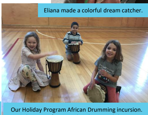
Our Holiday Program African Drumming incursion. This was a fantastic, hands on workshop.