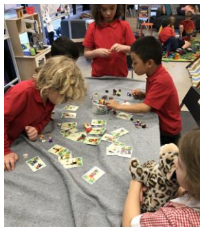
We have been so engulfd in reconfiguring Lego Mini figures!