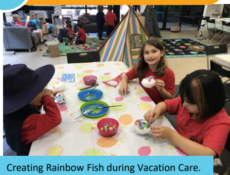
Creating Rainbow Fish during Vacation Care.