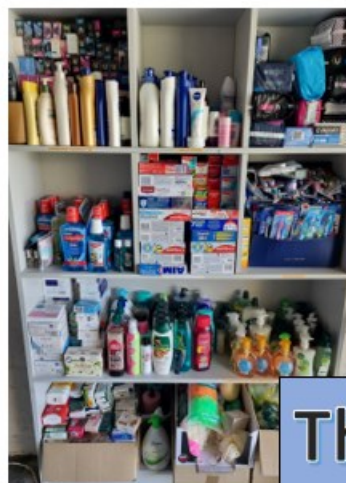
A sample of the donations received.

wishes to thank our 3 Primary Schools for their wonderful support this Winter. Each school has collected toiletries which have been helping many families in our Parish area. Thank you to the children and to parents for supporting the schools in this endeavour.