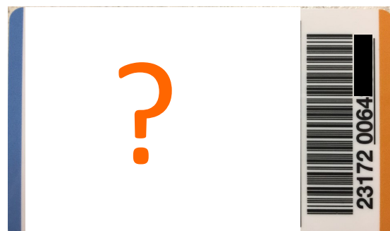
New junior card

Draw your design on the other side of this entry form.