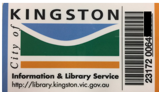
Current Kingston Library card

(by signing you are agreeing to the conditions of entry listed above)