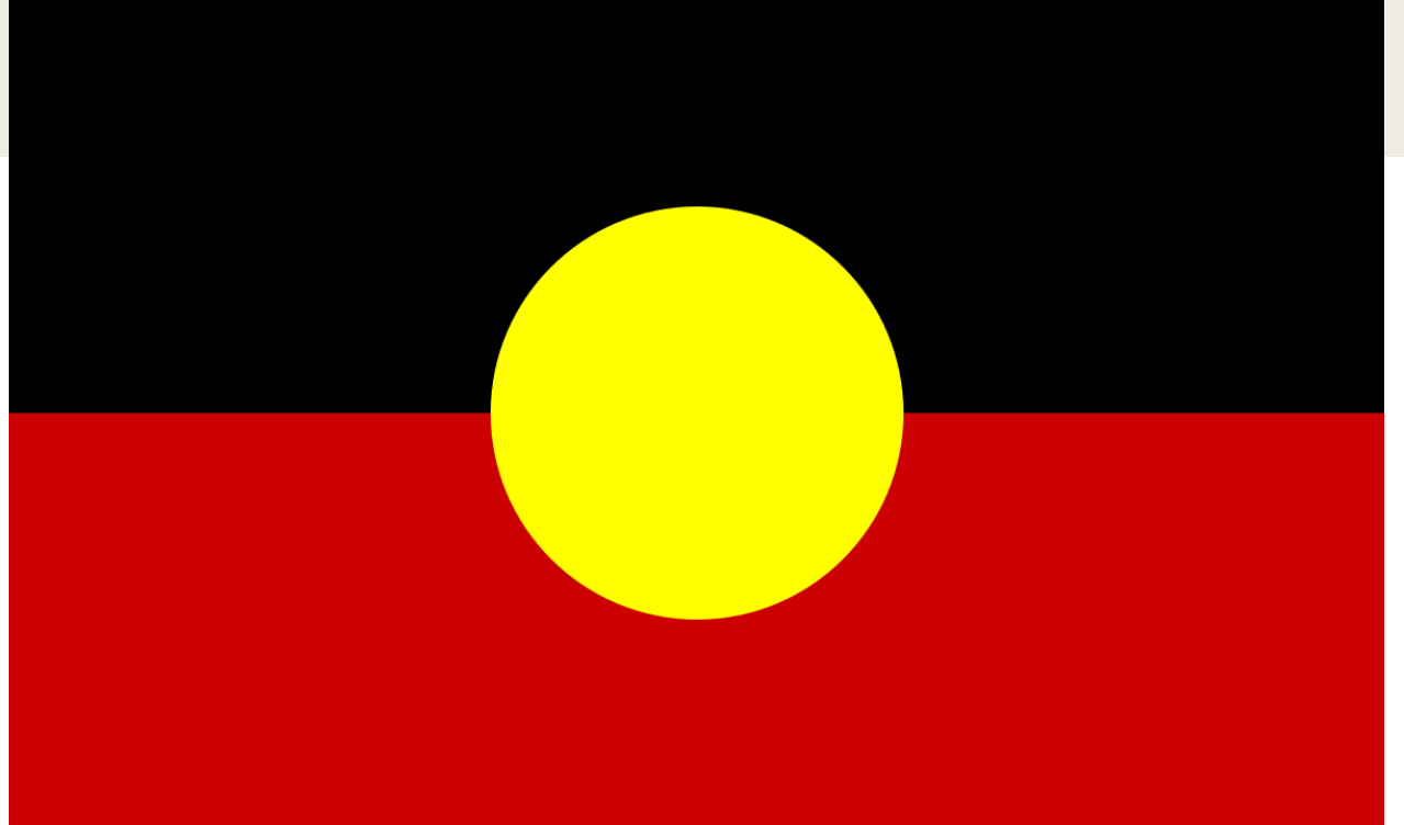
The aboriginal flag