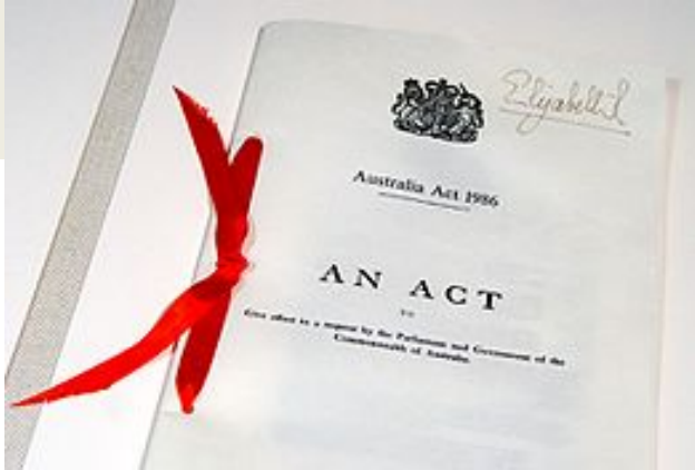
The constitution of Australia.