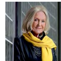
Prof. Ing. Arch. Eva Jiříčná

Founder Governor of The English College in Prague. Free-lance editor and consultant. Former Member of Her Majesty's Diplomatic Service who spent most of her diplomatic career dealing with Central and Eastern Europe.