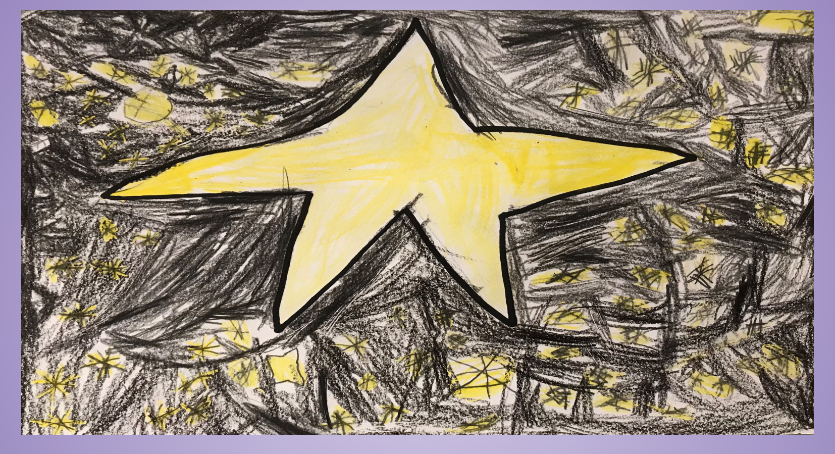
"When we were in the east, we saw his star. Now we have come to worship him."