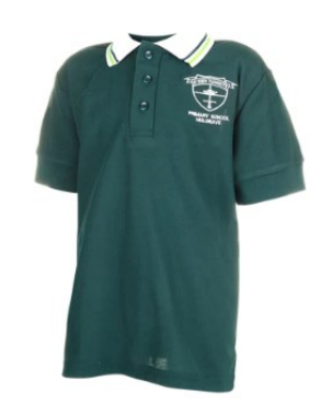
Green Short sleeve Polo