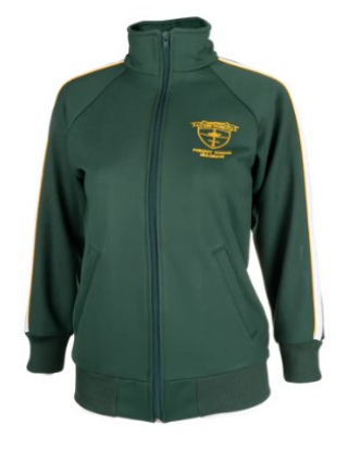
Sport Track Jacket