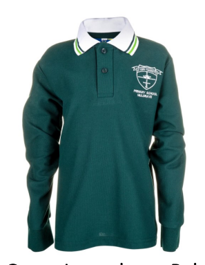
Green Long sleeve Polo