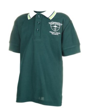
Green Short sleeve Polo