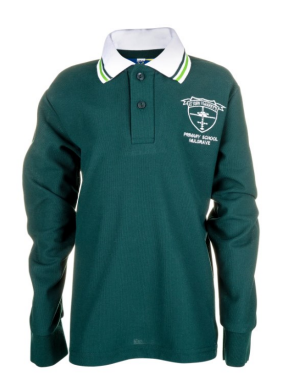
Green Long sleeve Polo