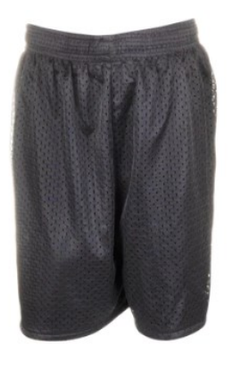
Sport Mesh Shorts