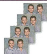
4 - wallets