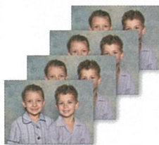
4 - 9x13cm