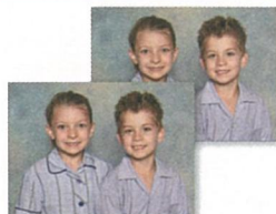
2 - 13x18cm