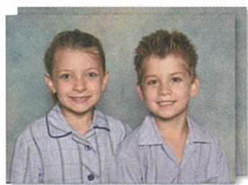
2 - 20x25cm