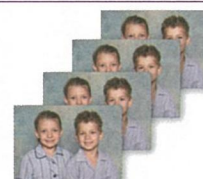
4 - 6.5x9cm