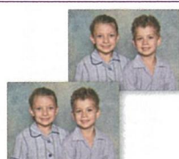
2 - 9x13cm