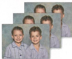
3 - 13x18cm