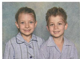
1 - 20x25cm