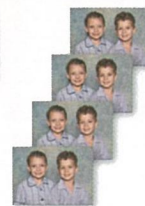
4 - wallets