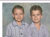
1 - 13x18cm