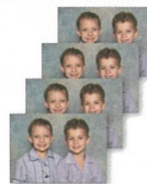
4 - 6.5x9cm