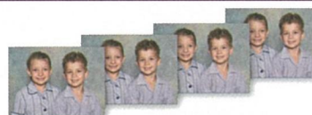
4 - 6.5x9cm

Credit Card Voucher. If you are using credit card facilities, please detach this slip and place inside envelope.