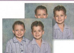
2 - 13x18cm