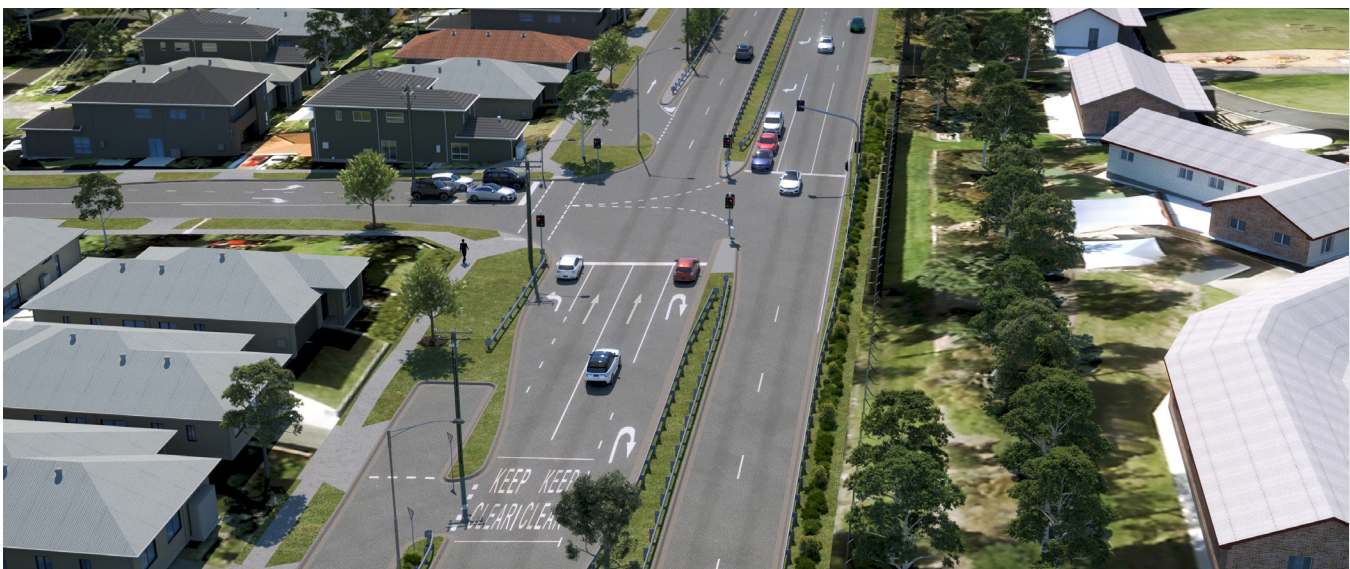
Artist impression of the upgraded Ballarto Road and Greenwood Drive intersection.