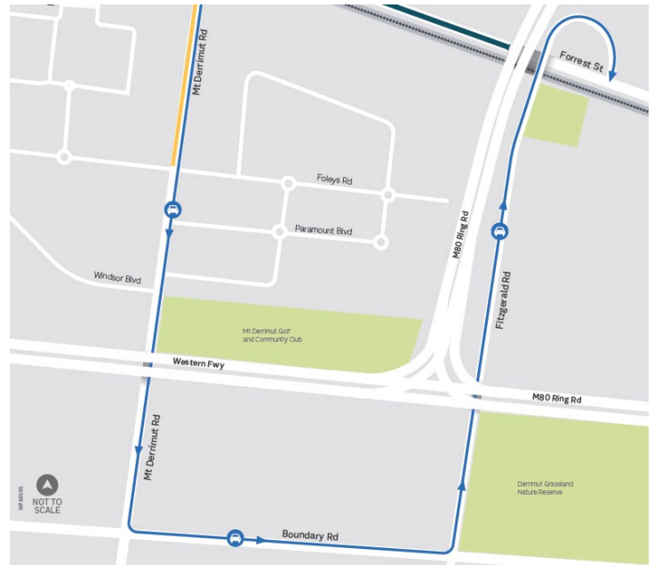
Map 2. Travel changes from 7pm Friday 18 August to 5am Monday 21 August