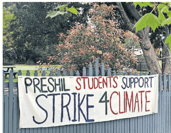
Preshil students learn to be engaged citizens, raising awareness or taking a stand on issues.

consider provocations and problems and look at ways of solving those, so you get a lovely through-line between the PYP and that MYP where students are looking at themselves as learners on the planet here and now, and asking what it is that they can take on. In the DP, creativity action and service bring these things to their natural conclusion."