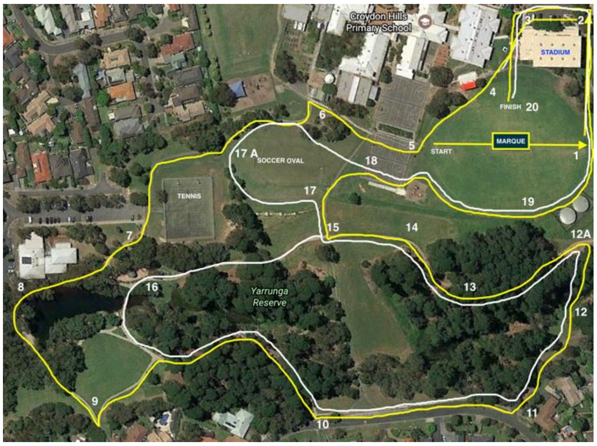
(ignore the Marque on the oval as this is the House Cross Country map which we usually have during school