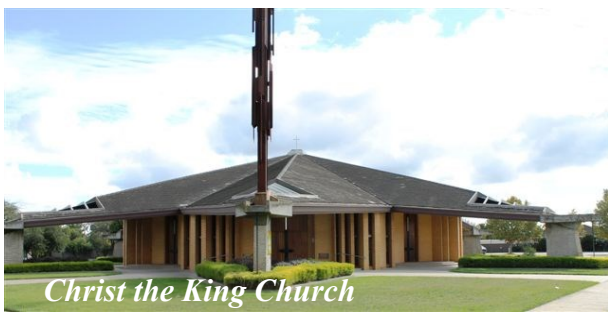
Christ the King Church