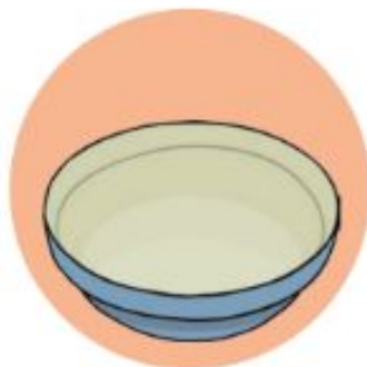
small microwavable bowl