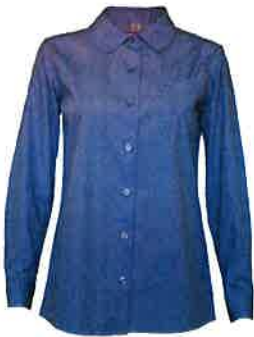
Peter Pan Blouse Lng Slv Blue