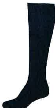
Knee High Sock Navy