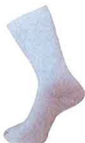
Sock Anklet White 2 pkt