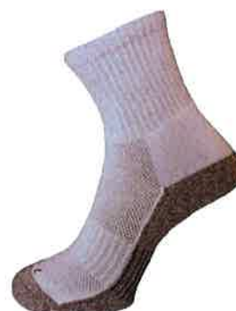
Sport Sock 2 pkt

For current prices, please refer to www.bobstewart.com.au