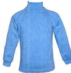
Skivvy Sky Blue