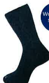
Sock Crew Navy 2pk