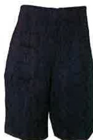
Shorts Elastic Back Navy