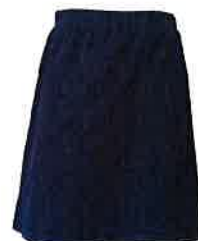
Sports Skort Navy