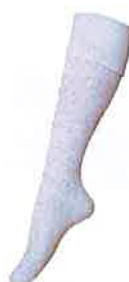
Knee High White 2 pkt