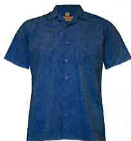
Shirt Short Sleeve Blue