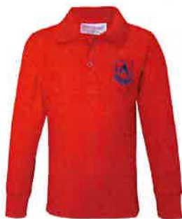
Sports Polo L/S