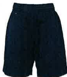
Sports Shorts Navy