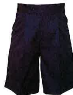
Shorts Fly Front Navy