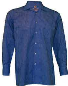
Shirt Open Neck Lng Slv Blue