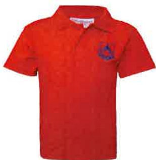
Sports Polo S/S