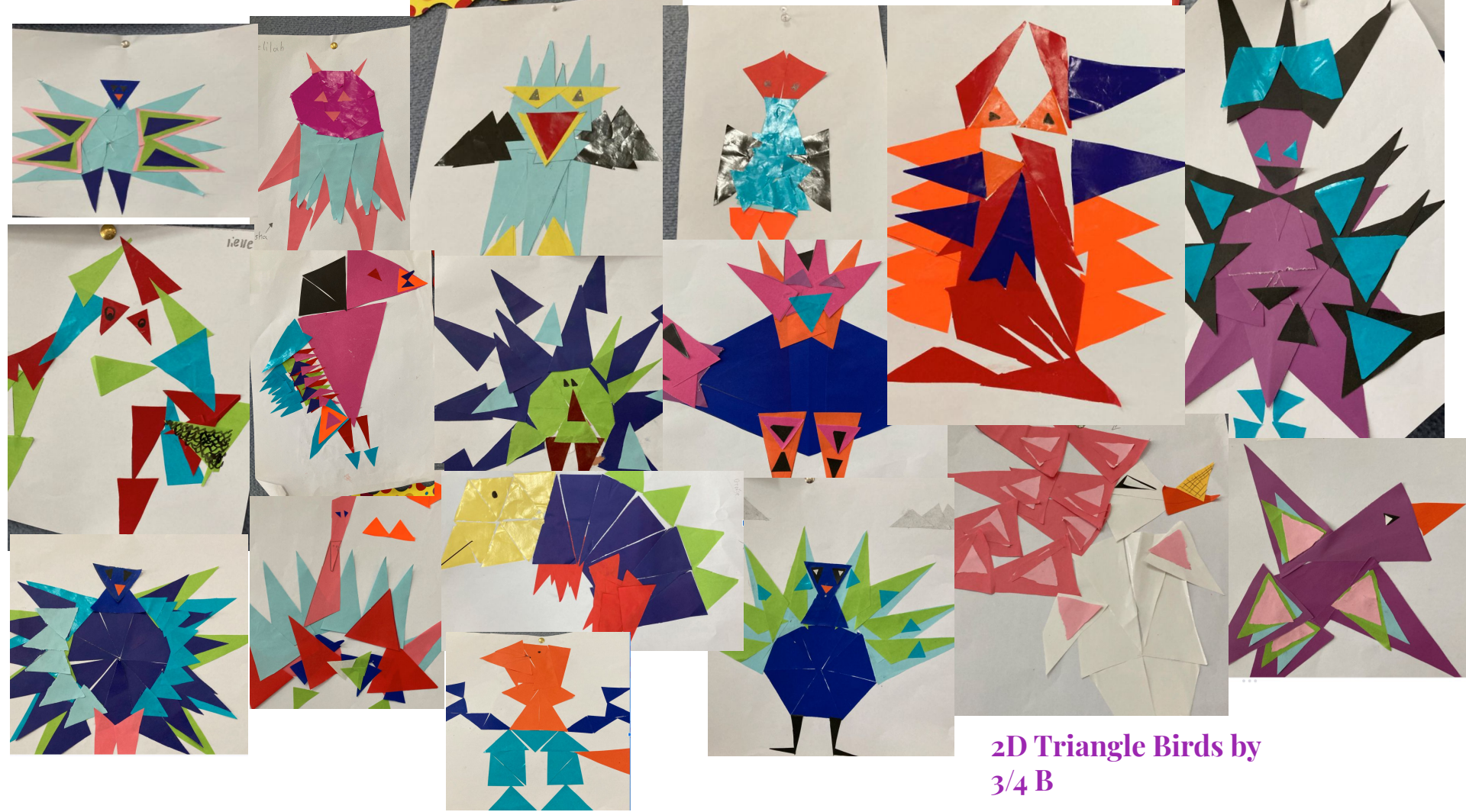
2D Triangle Birds by 3/4 B