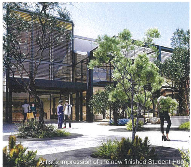
Artist's impression of the new finished Student Hub.