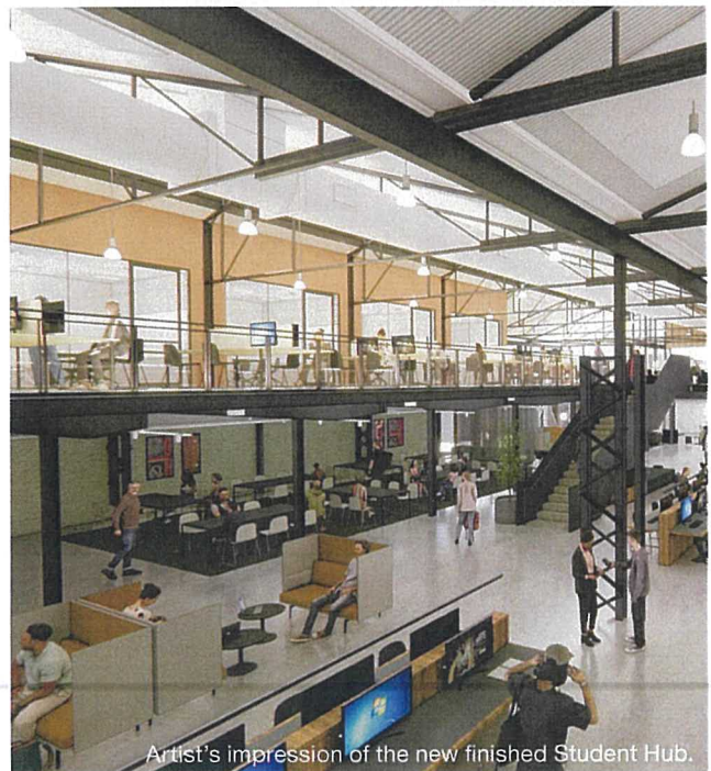
Artist's impression of the new finished Student Hub.