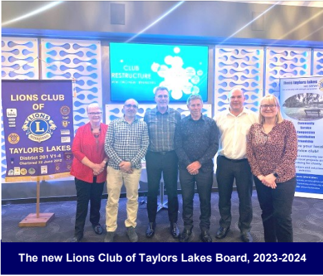
The new Lions Club of Taylors Lakes Board, 2023-2024

An annual function for the club is the Changeover Dinner, where the new Club Officers are acknowledged and installed - and this year's event was significant, as it marked some major changes to our Club Board.