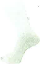
Sock Anklet 2 pkt