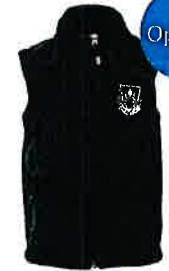
Polar Fleece Vest