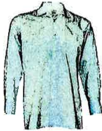
Shlrt Open Neck Lng Slv