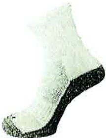
Sport Sock 2 pkt

For current prices, please refer to www.bobstewart.com.au