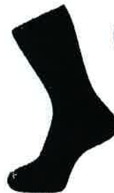
Sock Crew Navy 2pk