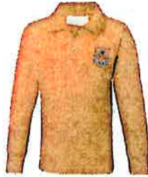
Sports Polo L/S