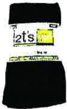
Tights Cotton Navy