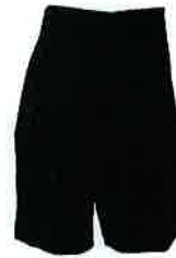
Shorts Elastic Back