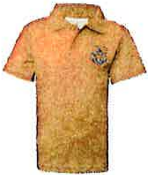
Sports Polo S/S