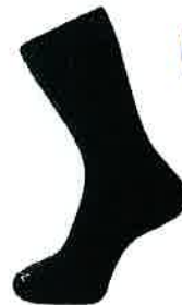
Sock Crew Navy 2pk