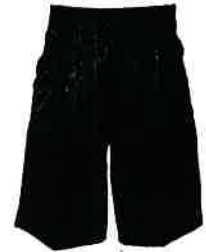
Shorts Fly Front