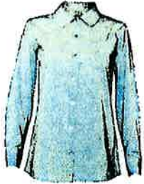
Peter Pan Blouse Lng Slv