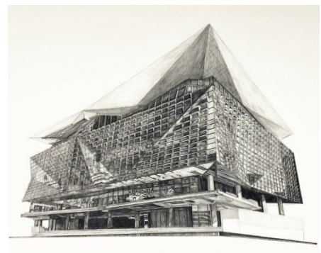
+ HSC VISUAL ARTS & INDUSTRIAL DESIGN (TIMBER) EXHIBITION