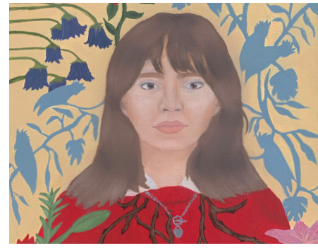
6PM - 8PM THURSDAY 24 NOVEMBER 2022 ART & DESIGN CENTRE