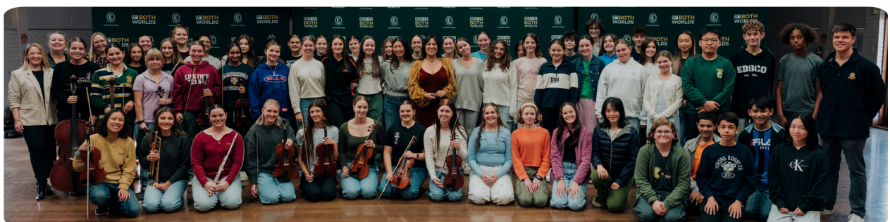
Student workshop with Kate Ceberano 2025