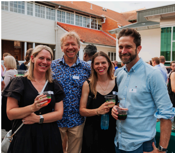
P&F Welcome Night 2025