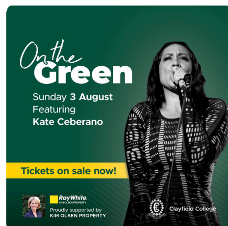
On the Green Digital Creative example 2025