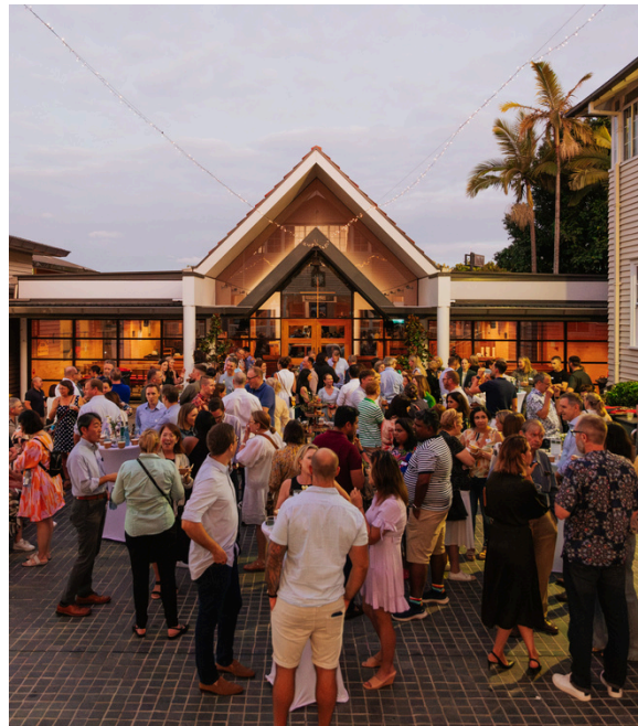
P&F Welcome Night 2025