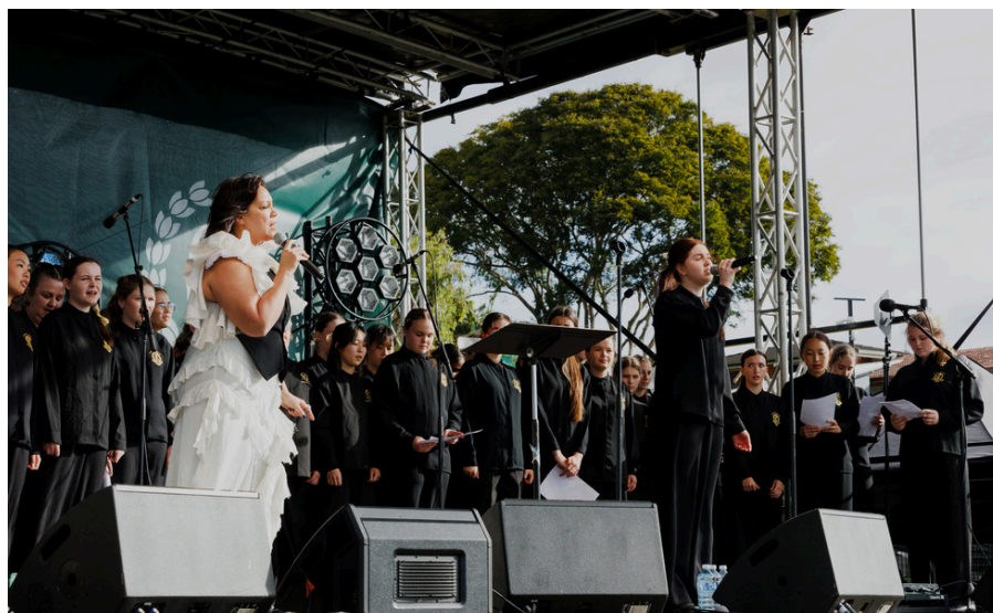
Kate Ceberano performing with Clayfield Music Students at On the Green 2025

On the Green is Clayfield College's flagship annual outdoor event, held on the Main Oval and open to the public. Featuring live music from professional, student, and community artists, along with a variety of food and beverages, it offers a relaxed, family-friendly atmosphere. The event also serves as the College's 'Back to Campus Celebration' for Old Collegians.