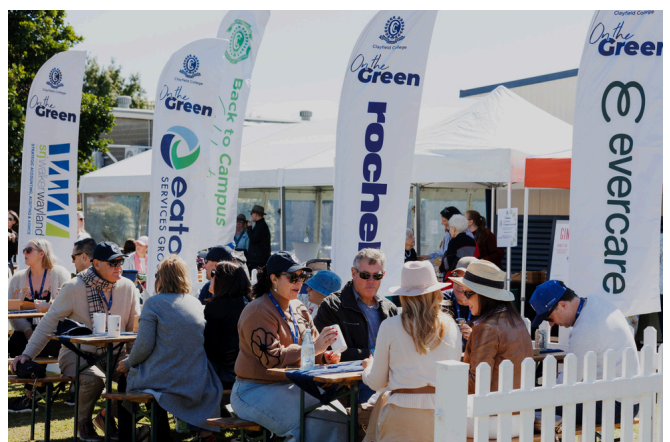
Dedicated Sponsor Areas - On the Green 2025