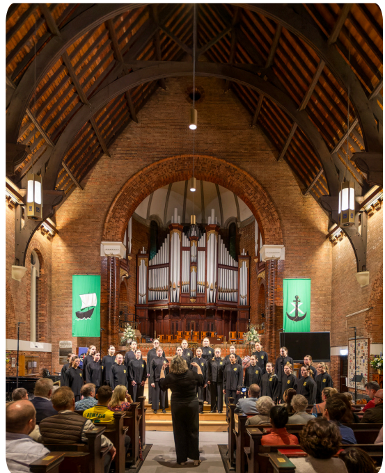
Opus 3, Saint Andrews Uniting Church 2025