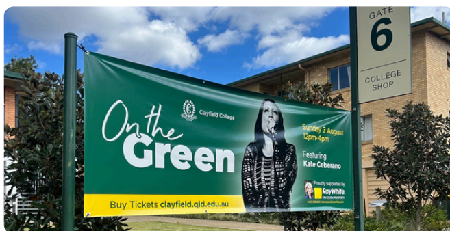
On the Green Bayview Terrace signage 2025