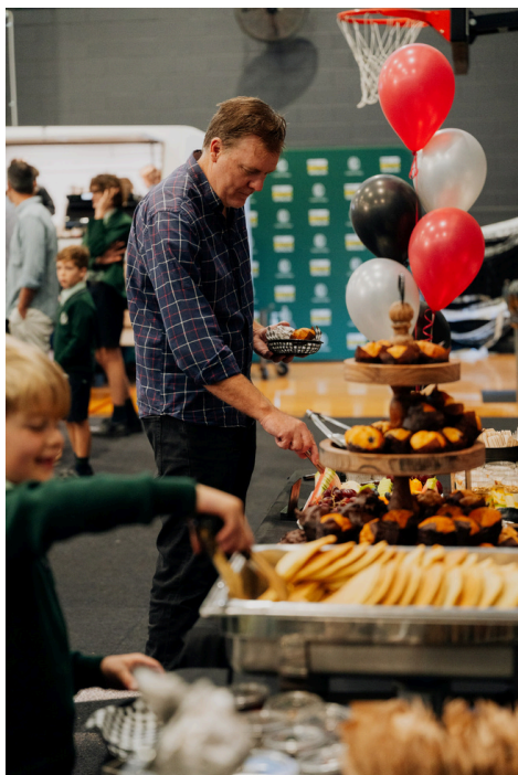
Dad's Diner 2025