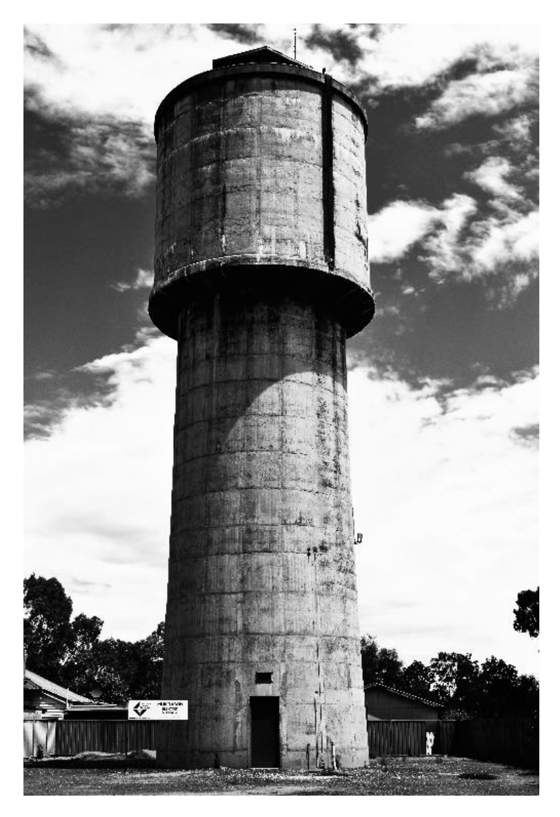
YEAR 10 PHOTOGRAPHY WITH MISS RICHARDSON