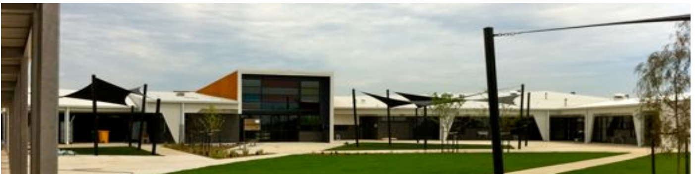
Central Agora (Courtyard)