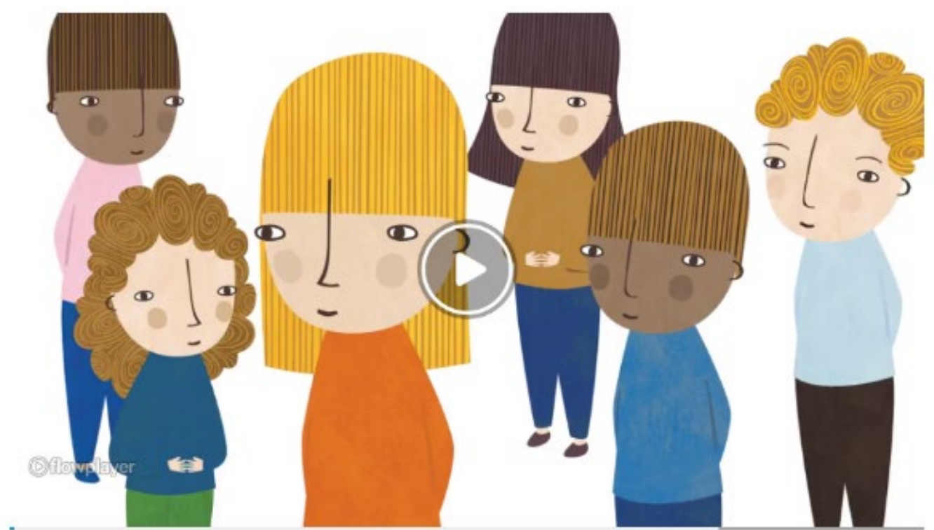
Video: Identifying signs of abuse