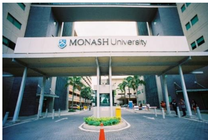
For use by Compass Career News Subscribers only - 2023