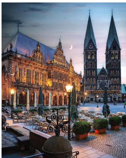
Discover history you never knew existed