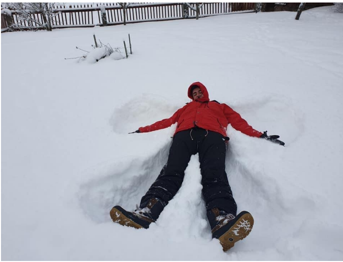
Maybe enjoy A European Winter?