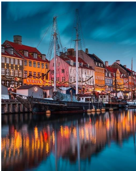
Perhaps a visit to Denmark on a Rotary Euro Tour?