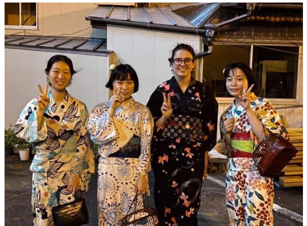
Maybe Japan is your choice destination? Or Norway?