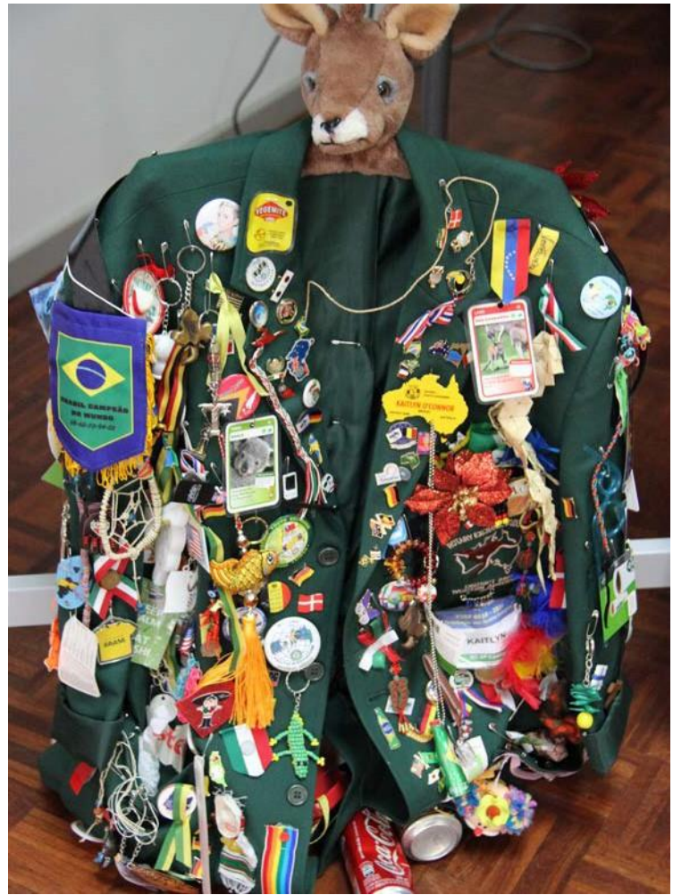
Prized possession...Your Rotary Blazer