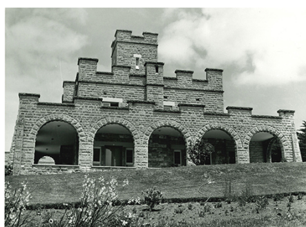
Deaf Catholic School in Portsea