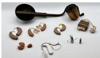
Evolution of Hearing Devices