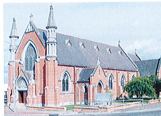
St Nicholas Church - East Tamworth