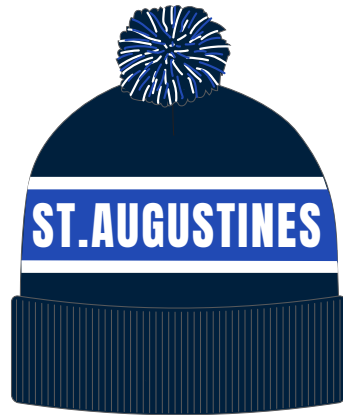
Jacquard Beanie Ink with Royal & White