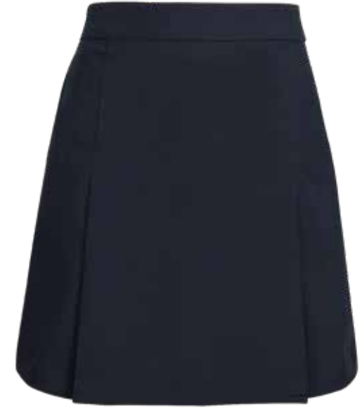
1101364 Microstretch Skort