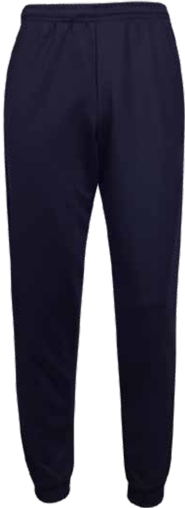
1169404 Unisex Cuffed Trackpants