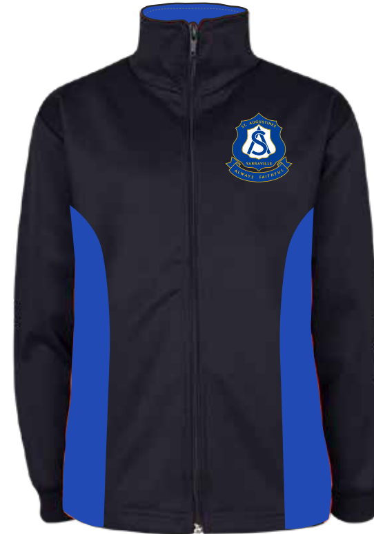
1162148 Sports Jacket with Contrast Panels Ink with Royal Panels