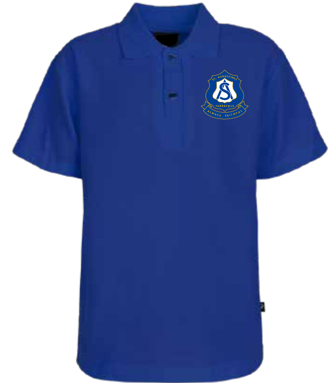
Style No. TBC Micromesh Sports Polo, Royal