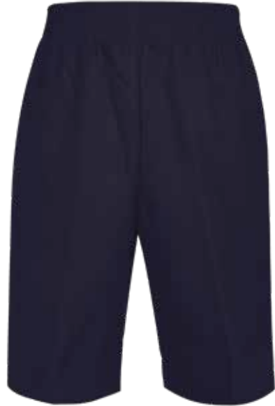
1110355 Unisex Zip Pocket Gaberdine Shorts