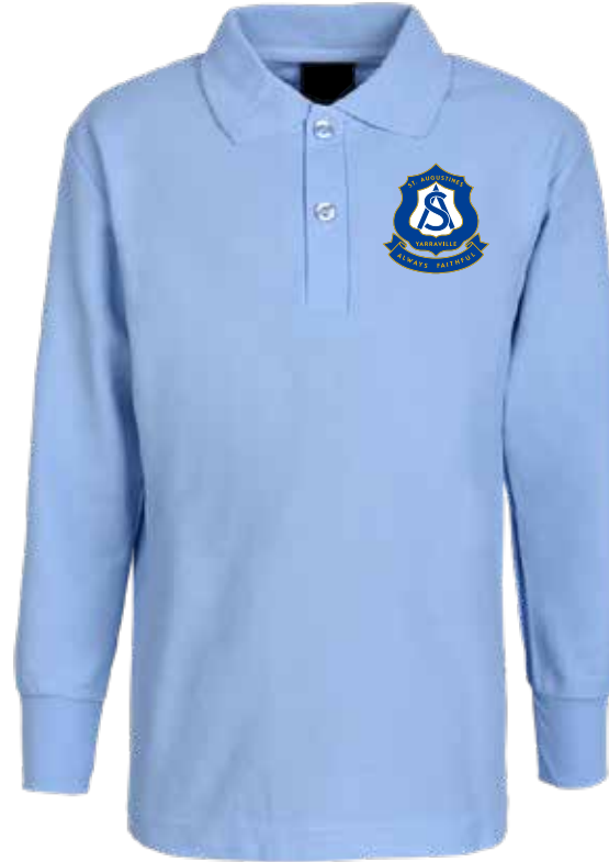
1160155 Long Sleeve Pique Polo Sky