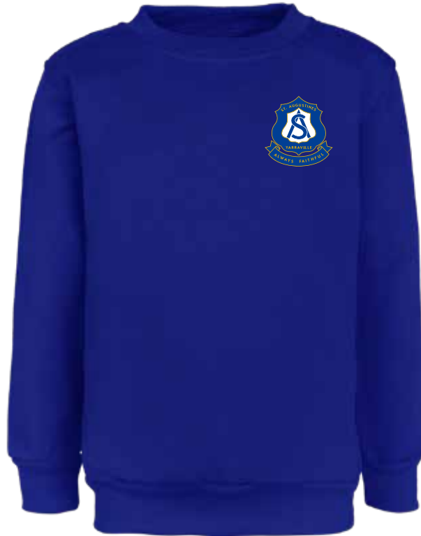
1100290 Crew Neck Windcheater, Royal