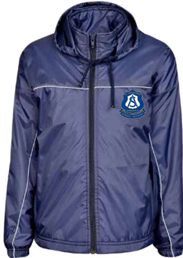
1162117 Unisex Rain Jacket, Navy