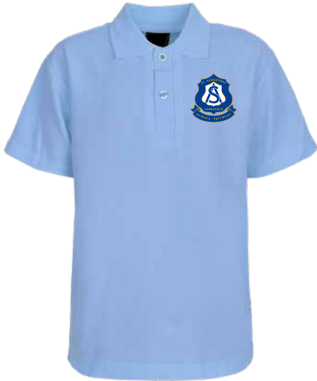
1160105 Short Sleeve Pique Polo Sky