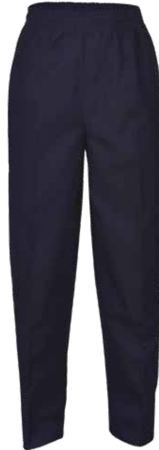
110400 Unisex Elastic Waist Gaberdine Pants