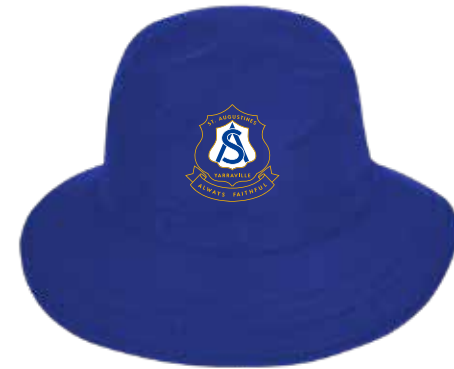
Hybrid Bucket Hat