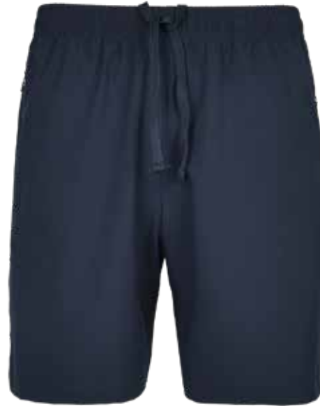
1111569 Unisex Microstretch Zip Pockets