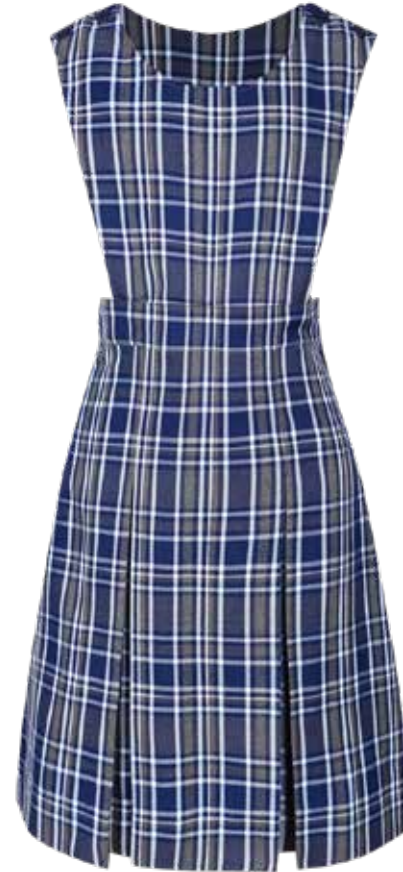
1164015_541 Detachable Pinafore