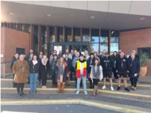
NEVR KEW staff at Rumbalara Aboriginal Co-operative

The recent Aboriginal workplace gathering provided a unique and enriching experience, bringing together colleagues from the NEVR Koorie Workforce and Regional staff to celebrate and immerse themselves in the rich cultural heritage of our First Nations peoples. This event not only fostered a deeper understanding of Aboriginal culture but also emphasized our collective commitment to advancing the Marrung Aboriginal Education Plan.