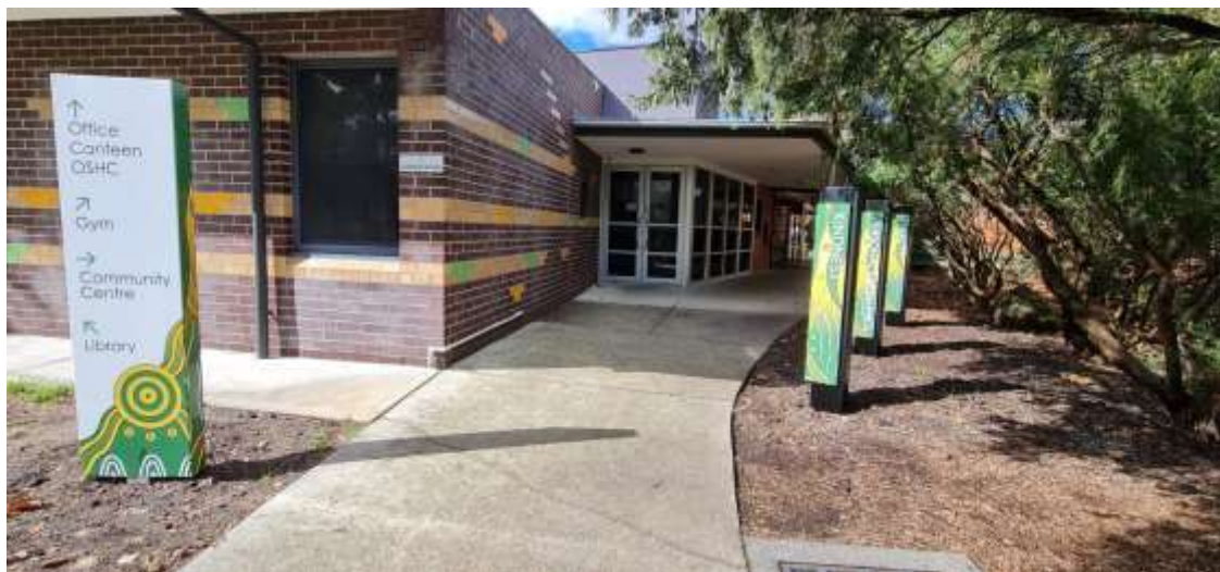
Karoo Primary School Entrance

Kudos to all those involved in this project for their creativity and commitment!!