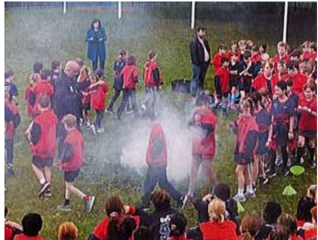
Participating in the Smoking Ceremony