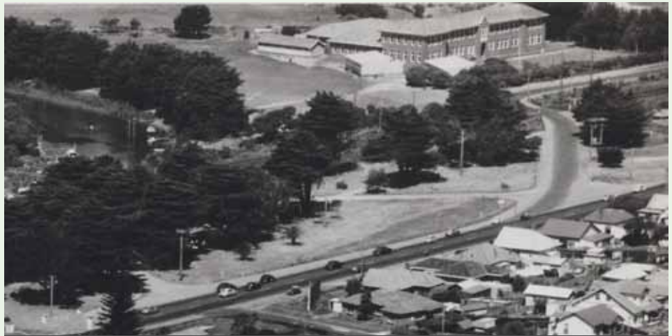
Aerial view of our school circa mid 50s