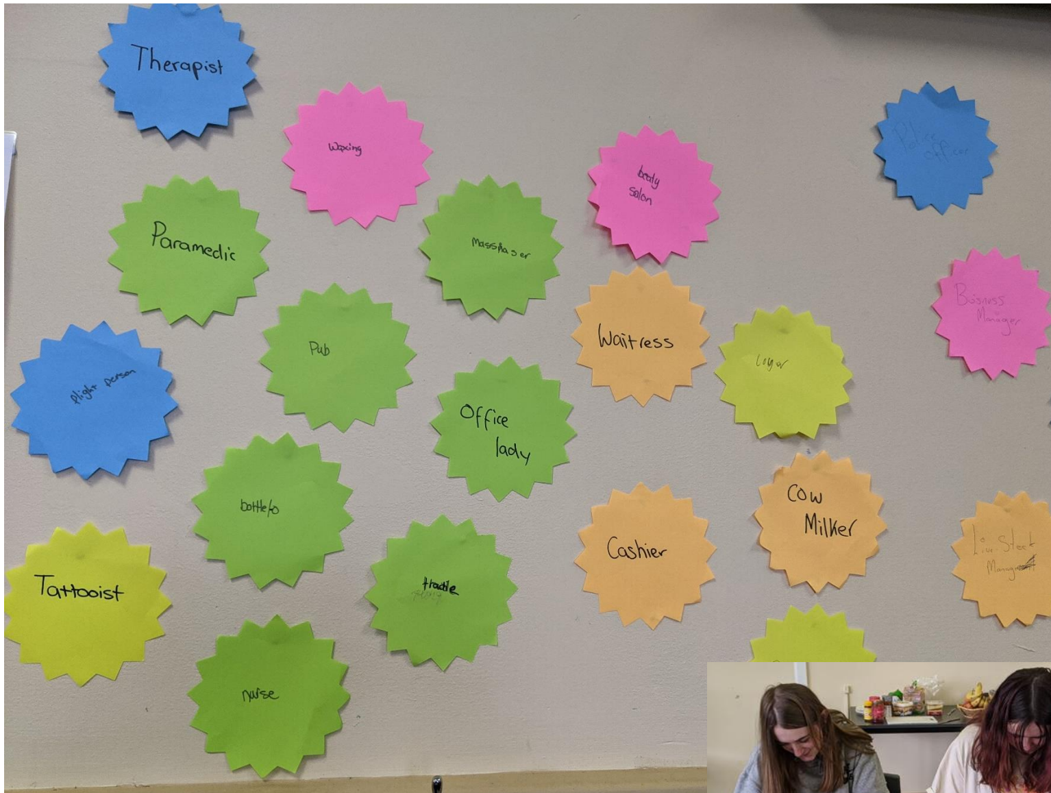
Picture Caption: A section of the display the students created of the various jobs available to do.