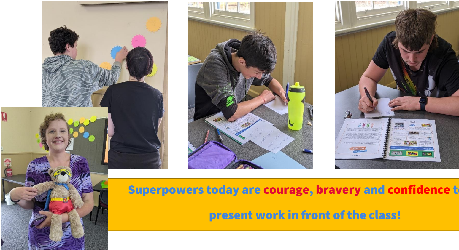
Picture Caption: Students writing all the many occupations they can think of.

Superpowers today are courage, bravery and confidence to present work in front of the class!