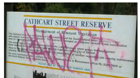
Cathcart Street Reserve

However the MOU clearly provides that Buninyong calls for graffiti removal "will receive priority" and that the logos of local groups on the unit will be maintained on the vehicle.