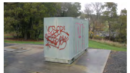
More damage in De Soza Park