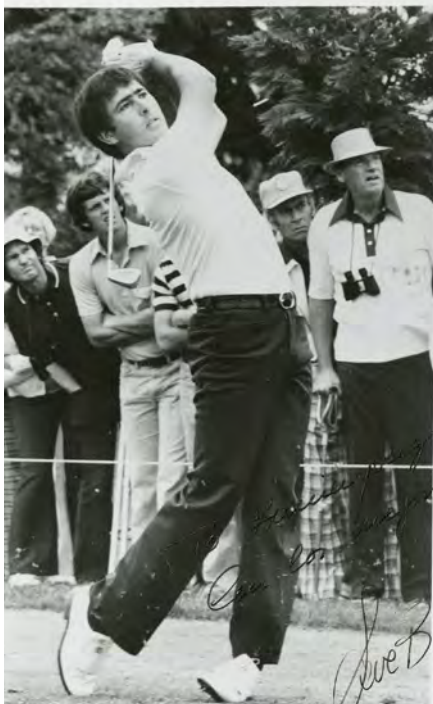
It was a big day in September 1978 when World No 1 golfer Seve Ballesteros played the Buninyong Golf Club course at the invitation of Ray Drummond.