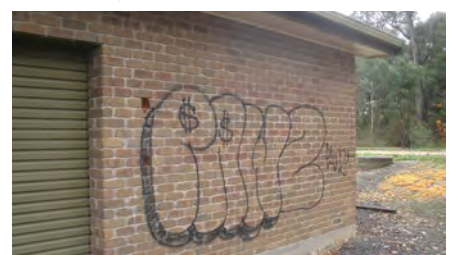
Pumping Station in De Soza Park west