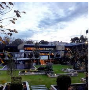
For use by Compass Career News Subscribers only