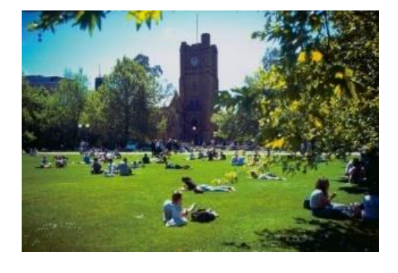
For use by Compass Career News Subscribers only