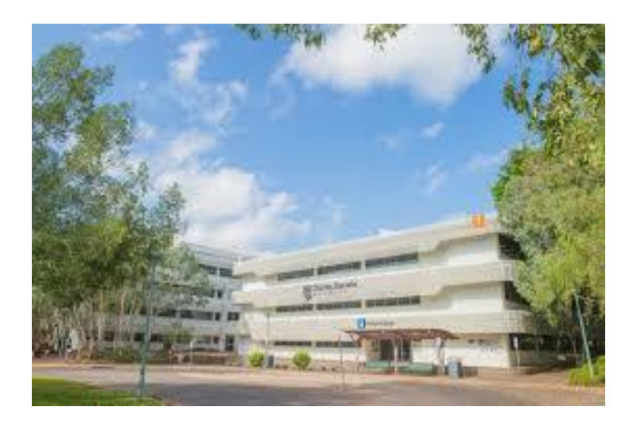
For use by Compass Career News Subscribers only