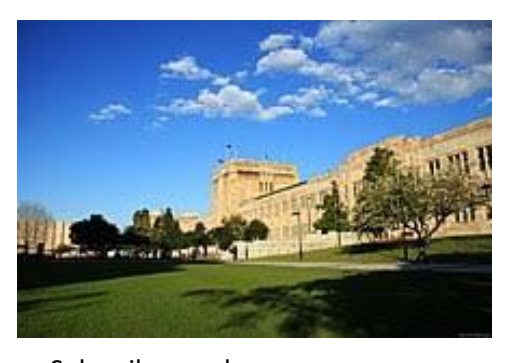
For use by Compass Career News Subscribers only