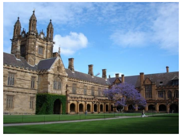
For use by Compass Career News Subscribers only