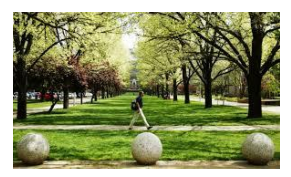
For use by Compass Career News Subscribers only