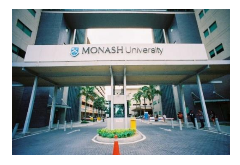
For use by Compass Career News Subscribers only