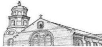
Our Lady help of Christians